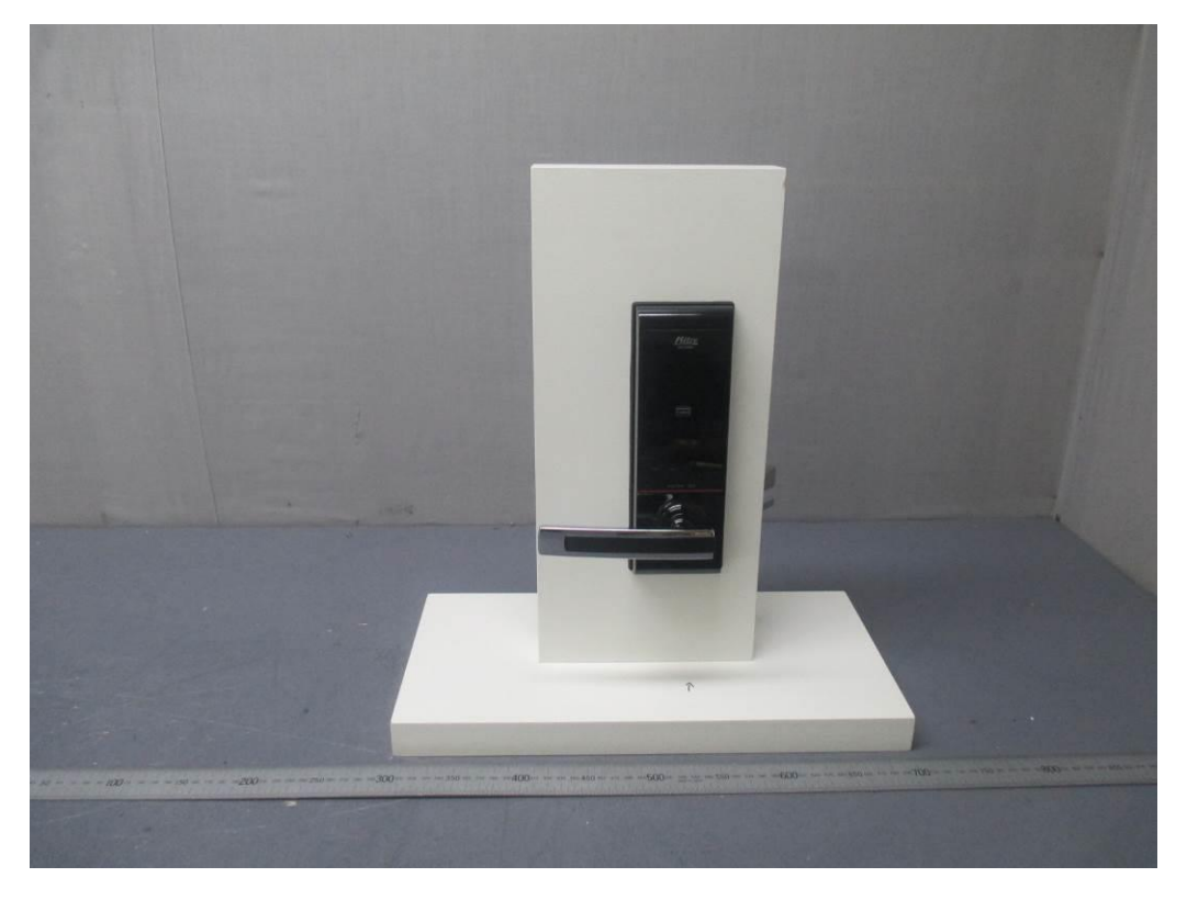
Model MMI-6000Outdoor Side View