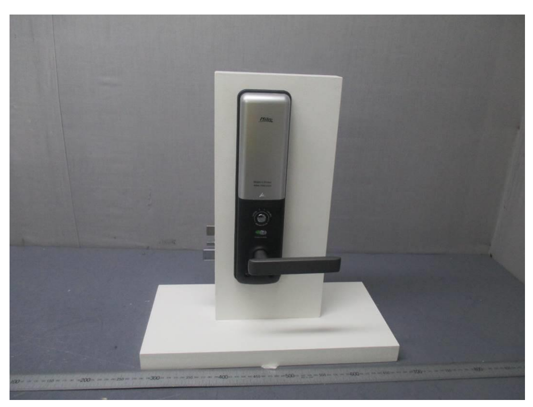
Model MI-5200S Indoor Side View