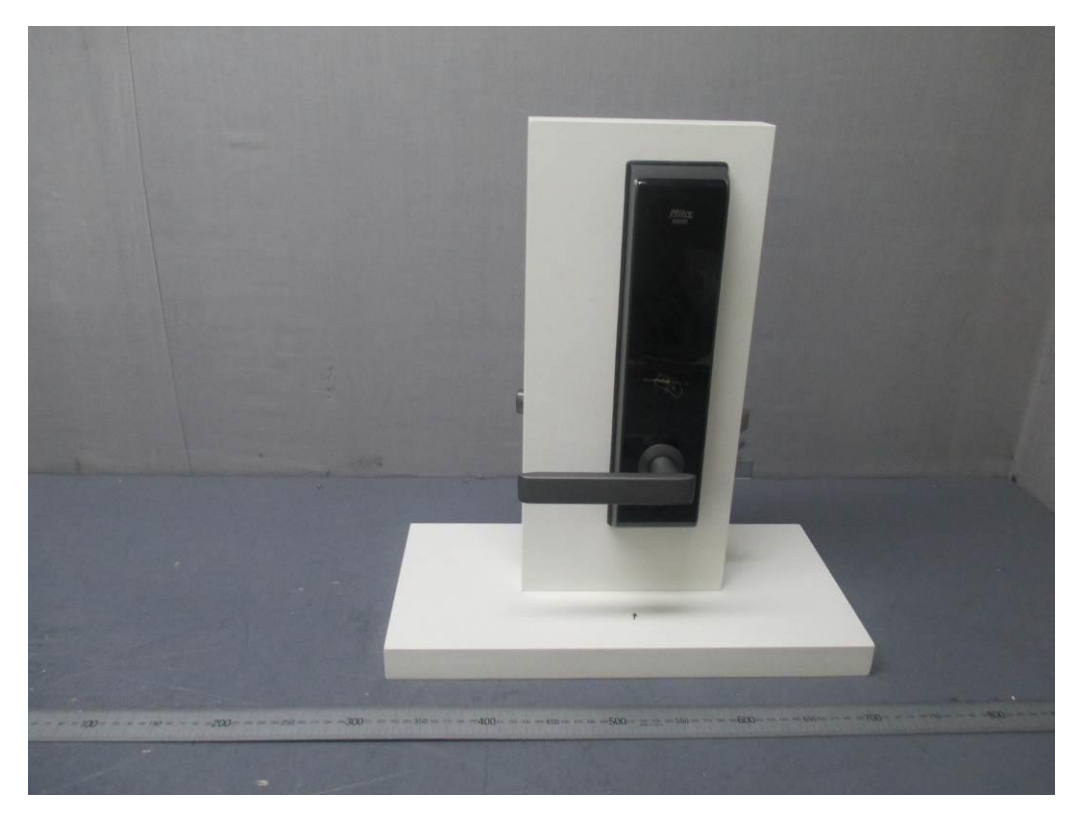
Model MI-5200S Outdoor Side View