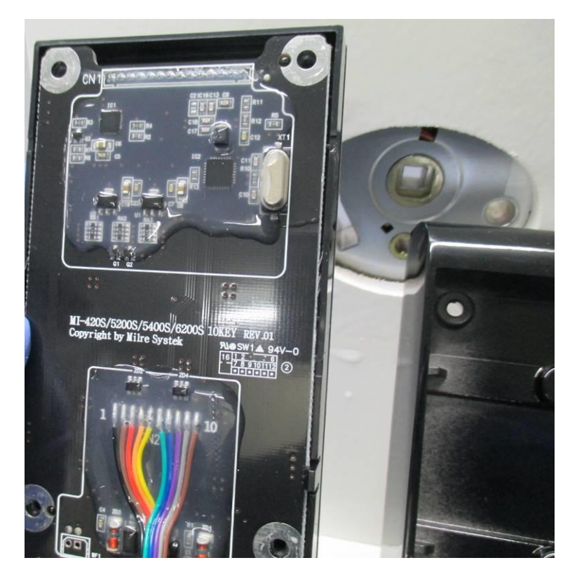
Model MMI-6000Internal View