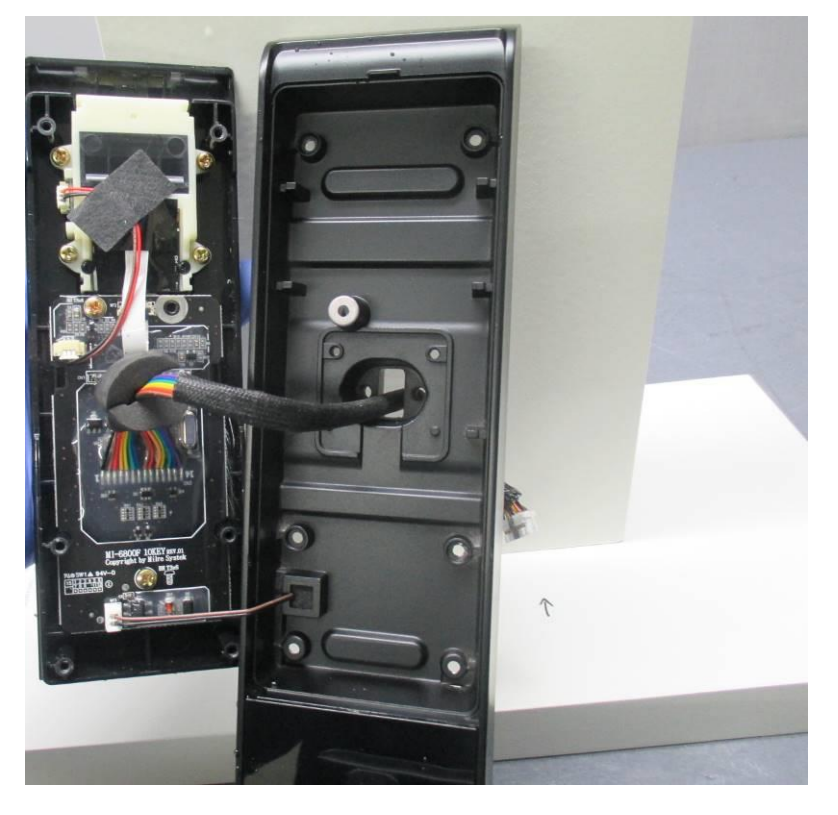
Model MI-6800 Internal View