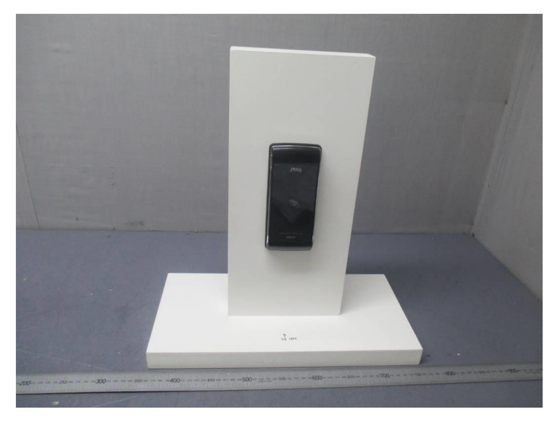
Model MI-480S Outdoor Side View